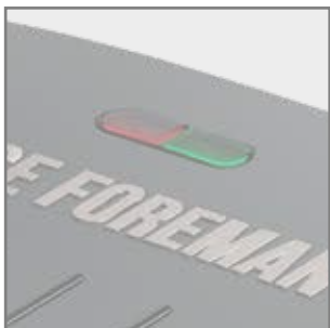
Temperature Indicator Light

*From 1/4 lb. 80/20 ground chuck. **Compared to George Foreman® removable plate grill, GRP0004.