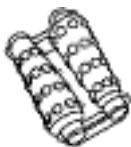
Massage Rollers (P/N 50542)